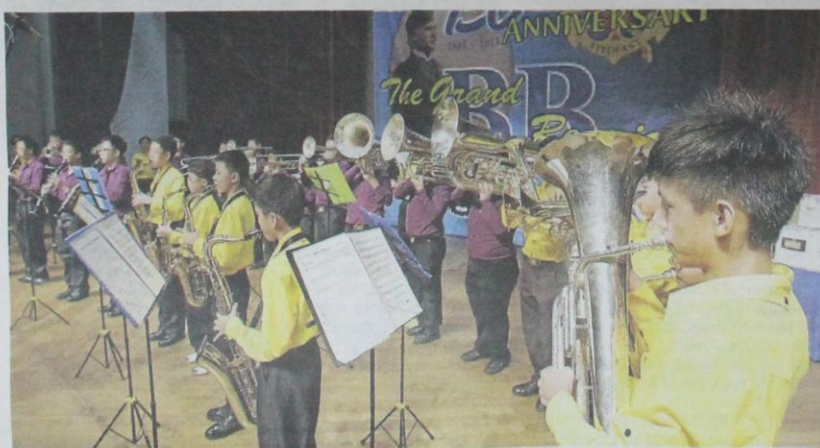
The Boys' Brigade is also well-known for its brass band.

Published in New Straits Times on October 9, 2013