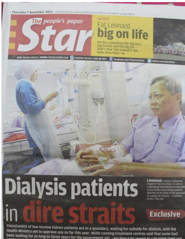
Published in The Star (front page) on November 7, 2013