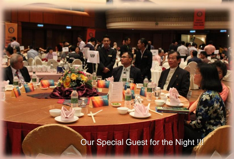
Our Special Guest for the Night !!!