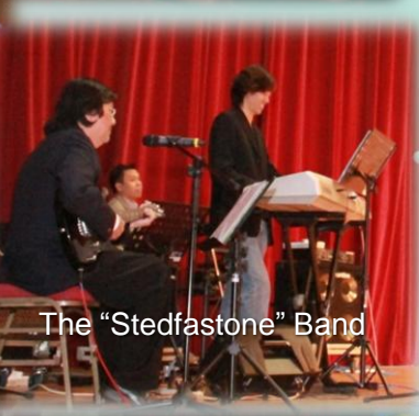
The "Stedfastone" Band