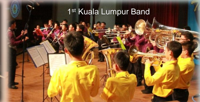
1 st Kuala Lumpur Band