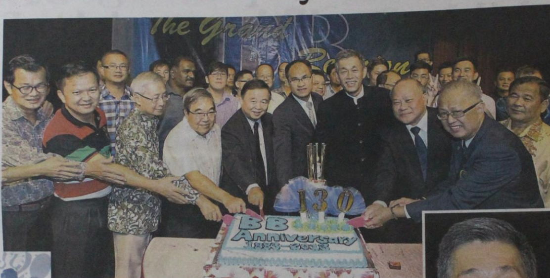
Members of the Steadfast Association Malaysia and Singapore cutting the Boys' Brigade's birthday cake.

"During my time, we would meet up every weekend to go camping,