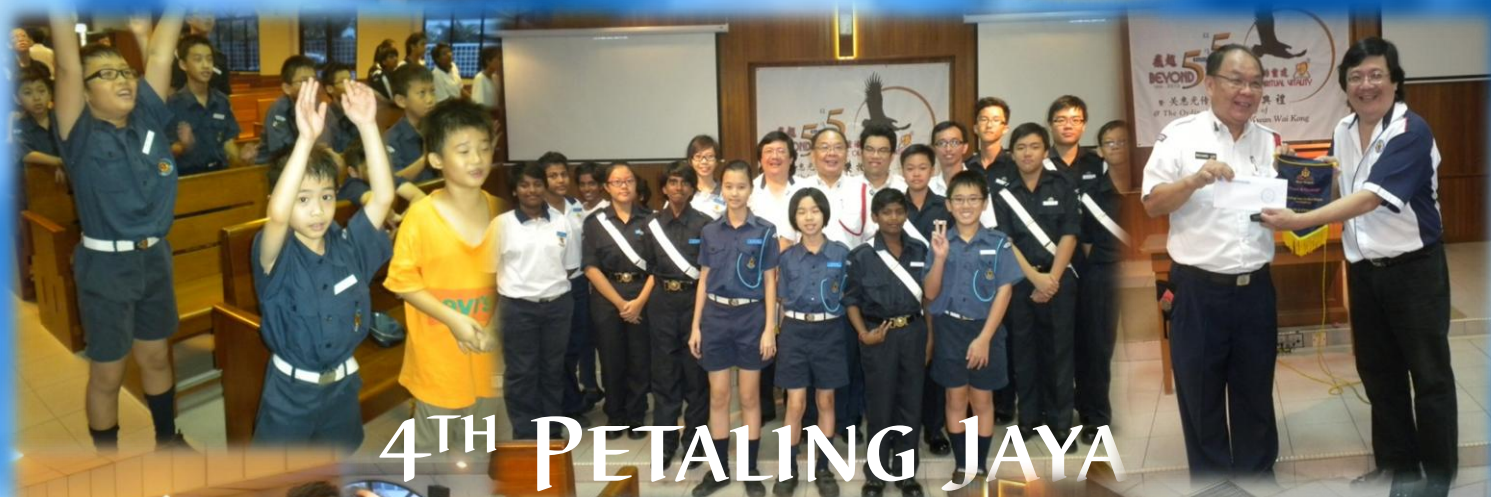
4 TH PETALING JAYA