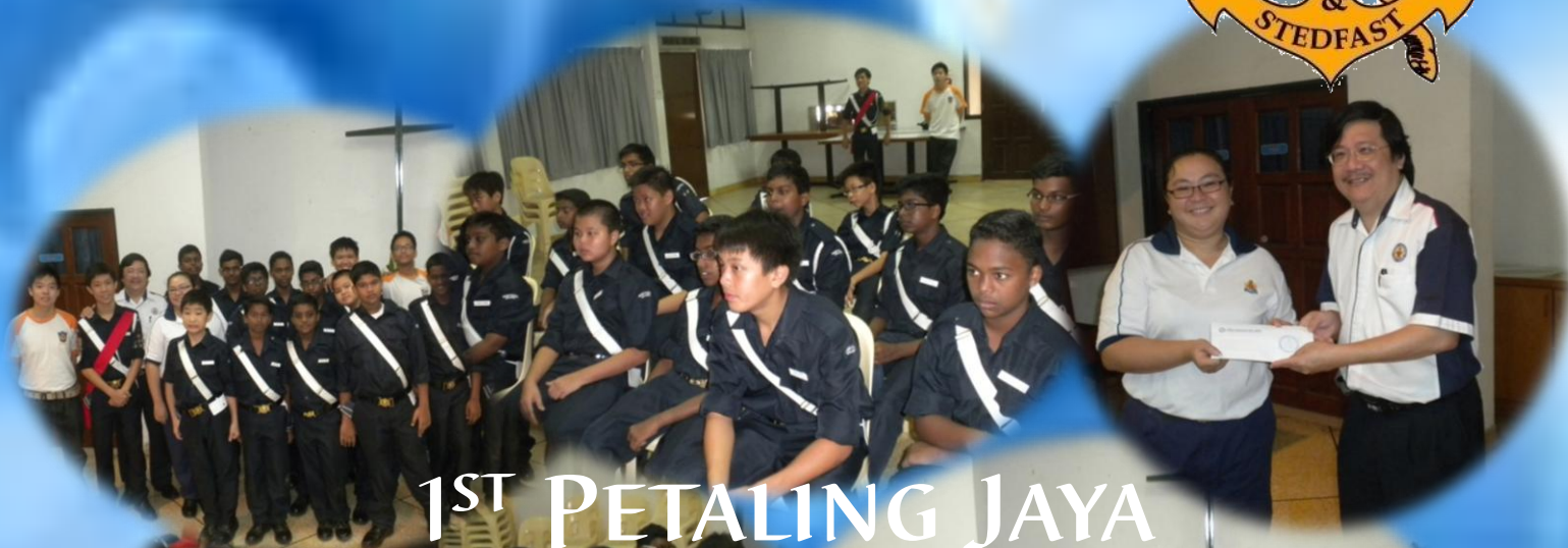
1 ST PETALING JAYA