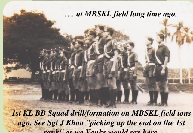
.... at MBSKL field long time ago.