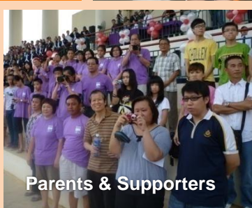
Parents & Supporters