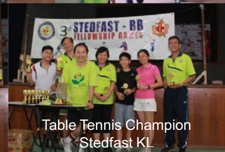
Table Tennis Champion Stedfast KL