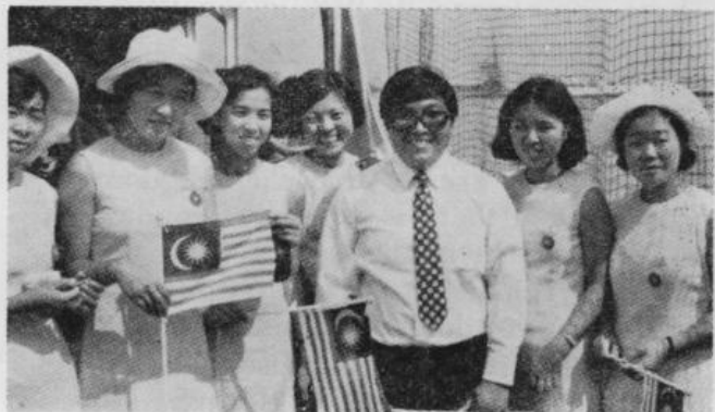
m m m m m .. .. what a collection!

We left Japan for Thailand, Indonesia and Malaysia with 300 Japanese youths on board the luxurious steamer, Sakura Maru. While on board the ship we received lectures on various aspects of Japan like its' history, economy, culture, education, etc. We also learned many Japanese folk songs and dances. Most important of all I think we learned how to understand each other's problems through the exchange of views and opinions.