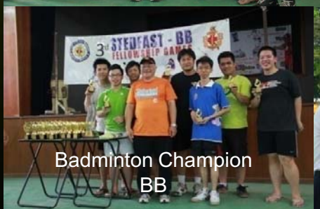
Badminton Champion BB