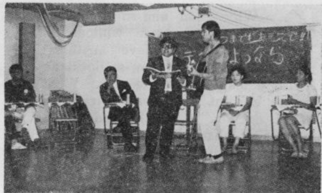
Let me sing to you