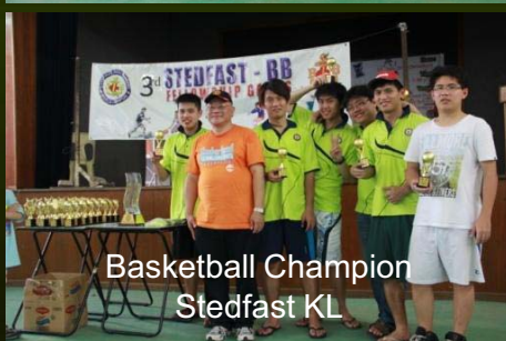
Basketball Champion Stedfast KL