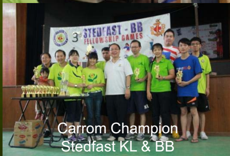
Carrom Champion Stedfast KL & BB