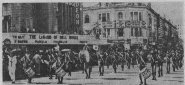
1st. K.L. Coy Band in National Day Parade

On the 25th August, our Band was invited to lead the March-past of the Tohbank Soccer Competition. On the 31st August our Band participated in the National Day Parade. Our Band led in the March-past of the Founder's Parade on the 7th October. The Company closed its session on the following Saturdays.