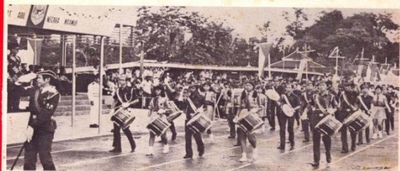
1st. Sibn Coy. march past saluting base on Malaysia Day

Articles from the Ranks Around the BB World Singapore Scene Around Malaysia the BB Way Late Company Reports Company Magazines Farewells—From and To the Junior Director The Anchor League Table Pen Pals BB Mail Bag Jokers Contest Corner