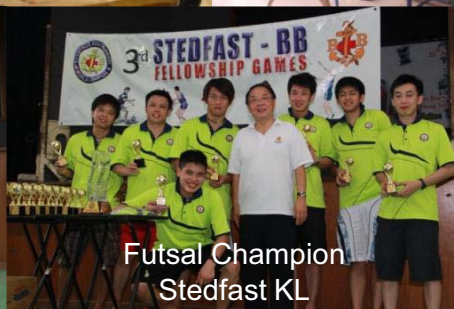
Futsal Champion Stedfast KL