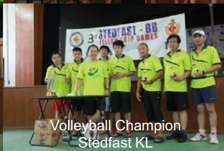
Volleyball Champion Stedfast KL