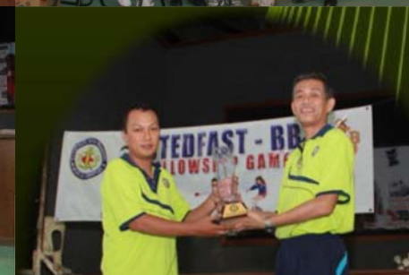
Overall Champion STEDFAST KL