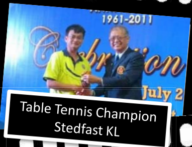
Table Tennis Champion Stedfast KL

Basketball 50 above shot-out Champion Stedfast KL