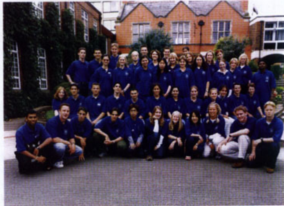
Participants of the Chester International Youth Centre 2002

The International Youth Centre was scheduled to be from the 23 rd of July till