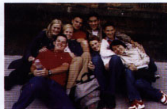
Having a great time by the roadside!