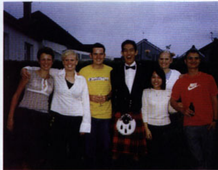
With friends from (l-r) Poland, Denmark, Mexico, Hong Kong, Finland and Croatia