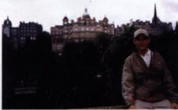
In Edinburgh, where the famous Edinburgh Castle is situated