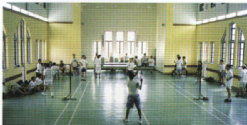
The beautifully renovated MBS School Hall was the venue for the Badminton, Carrom and Table-Tennis Competitions