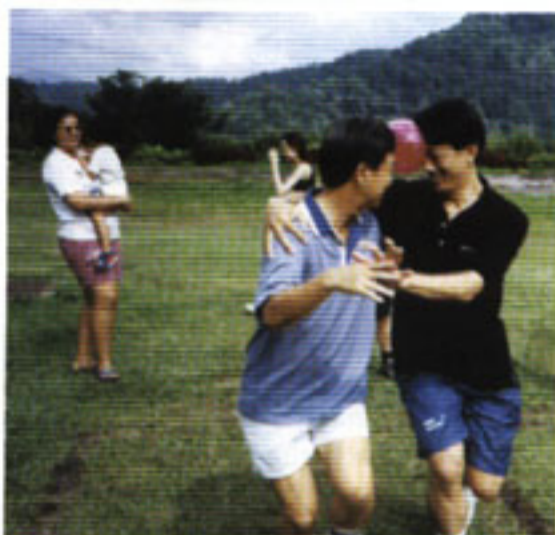
Kids... don't try this at home... even if you have a headache!