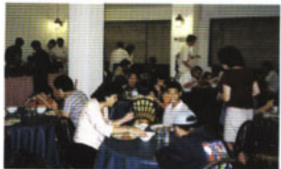
"Makan time" means "Happy Time"