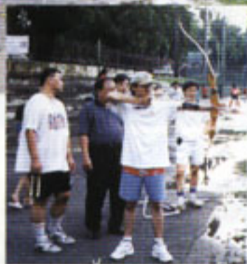
Robin Hood demonstrating the proper way to look like Robin Hood... "Gaya mesti ada!!!"