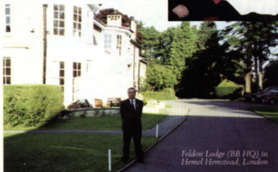
Feldon Lodge (BB HQ) in Hemel Hemstead, London

We started the year with an Executive Planning Retreat on the 6th of January to chart out our goals and programs for the year 2001. Then came the AGM in March. This time around, there was no election as the current Executive Committee's term is for two years. In April, the "old bones" of Stedfast KL took on the "young cikus" of KL Battalion in the "Stedfast KL vs KL Battalion Games". Believe it or not, we won the Challenge Trophy after beating KL Battalion in 4 of the 6 Games competed. We won in Football, Badminton, Basketball and Carrom but lost in Table-Tennis and Archery. Not bad eh!