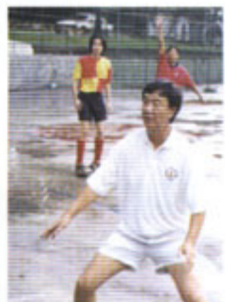
Are they playing "monkey" or basketball?