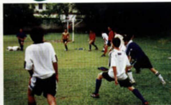
Look like serious stuff... isn't it?

The Stedfast Association Football Club (SAFC) was founded in the year 2000 but its foundations were built a long time before that. Starting from the year 1997, a group of BB Boys often communed in the MBS school field on Friday afternoons right after band practice to have a round of kickabout. Back then, there were no warm-ups or vigorous training sessions. We just came and 1...2...3...played football! After a while, due to complications and interference from the school authority we decided to shift the session to Sunday afternoons. This turned out to be a better choice, as most of the time our games would be uninterrupted and we could play until (literally) the sun went down. But after a while, some of us thought that this group could really go places, and we wanted to have a purpose and direction. True, we were having fun playing...but we wanted more.