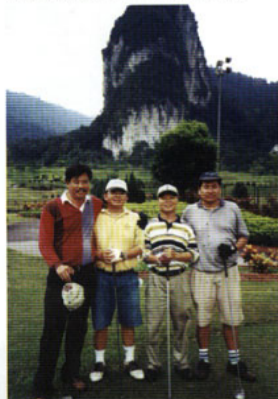
They look so contented with life... don't they? I would ... if I can play golf everyday!