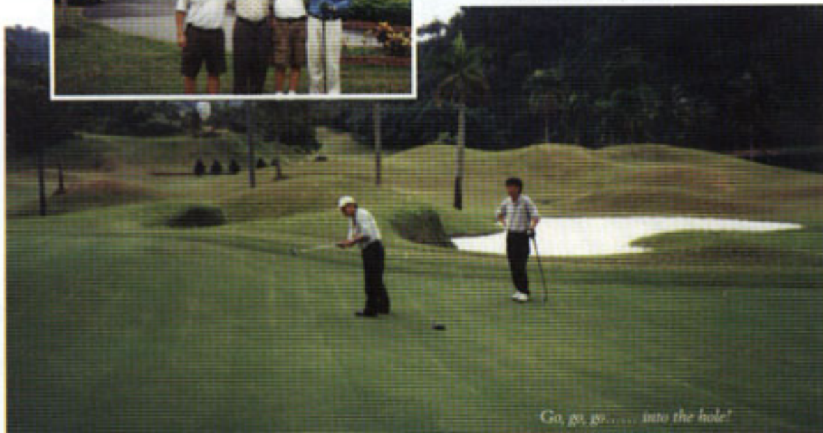
Go, go, go... into the hole!