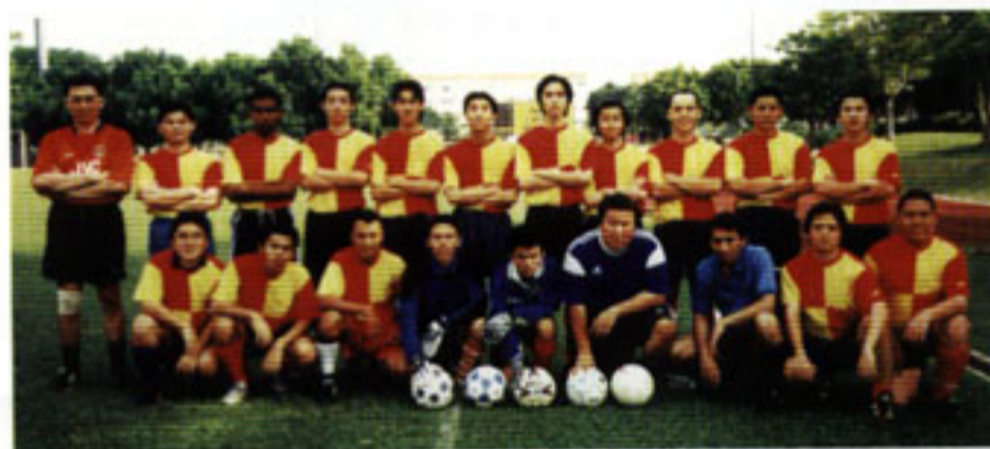
The Stedfast KL Football Team! ...like real ah!

If there's anything that is synonymous with the Boys' Brigade, it must be football. From the little junior boys to the old warhorses of the Officers, football is an enjoyable pastime and a great way to have fellowship and fun while working out.