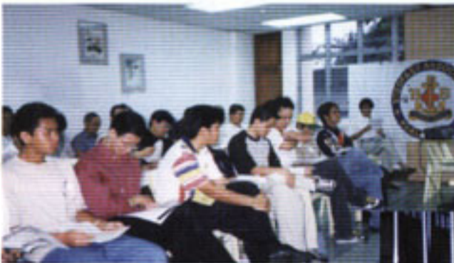
Members of the Stedfast KL attending the 6th AGM 2001