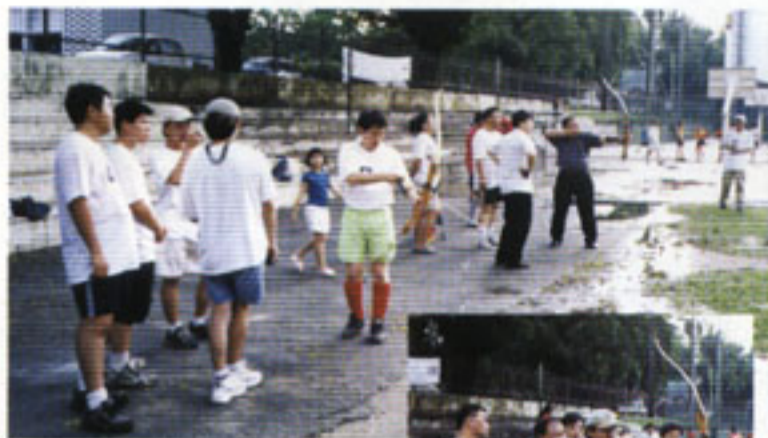
Ready, aim... fire!!!