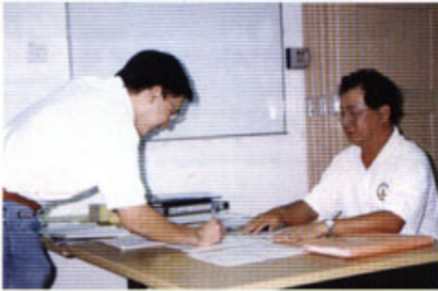
Ahh... please sign here... ahh... please pay here!!!