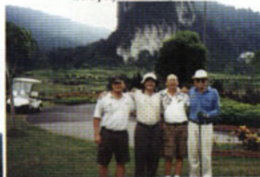
The weather and the championship golf course were perfect that day!

This tournament raised a sum of RM10,645.75.