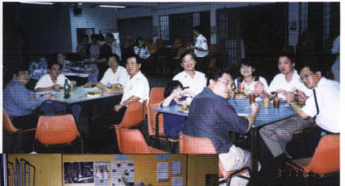
"Makan time" after the AGM - most exciting part of the program