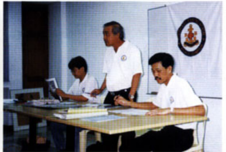
Opening address by the President with the Secretary and Treasurer backing him up