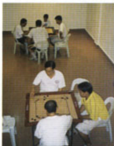
The intense atmosphere at the carrom boards