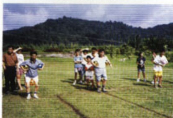
Men... trust me... two is all we can carry!!!