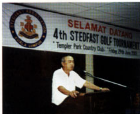
President giving his address