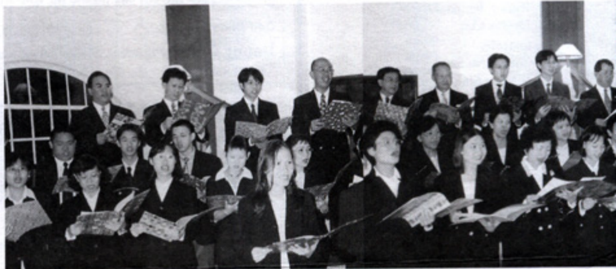
The GREAT Choir