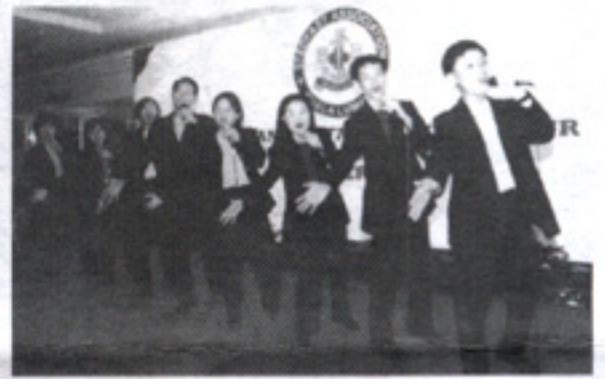
"IN-TRANSIT" from Singapore performing at the dinner