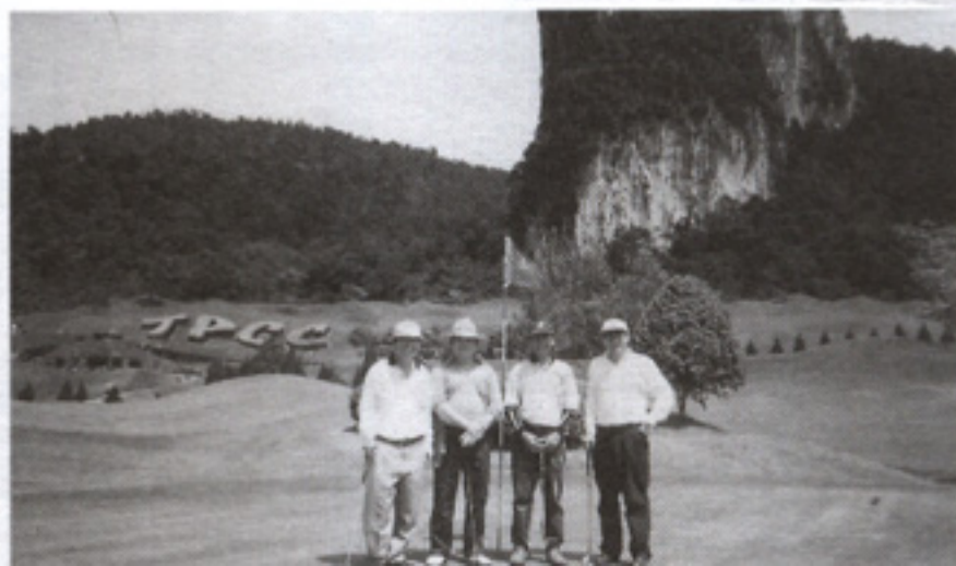
Golfers with the scenic background of the club