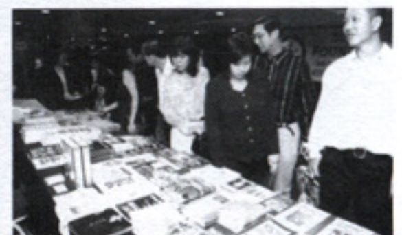
Guests browsing through some of the books on display