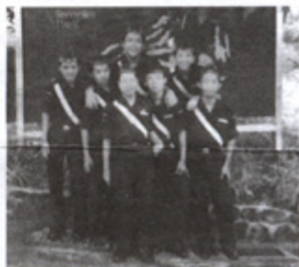
Templer Park Country Club's "Security Guards"