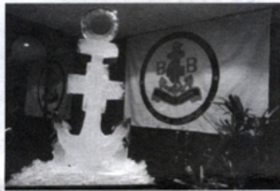
BB logo on ice-carving