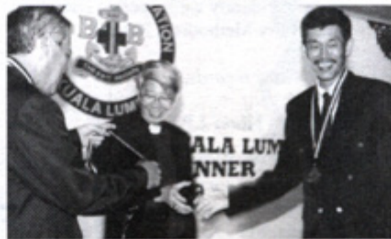
A happy moment