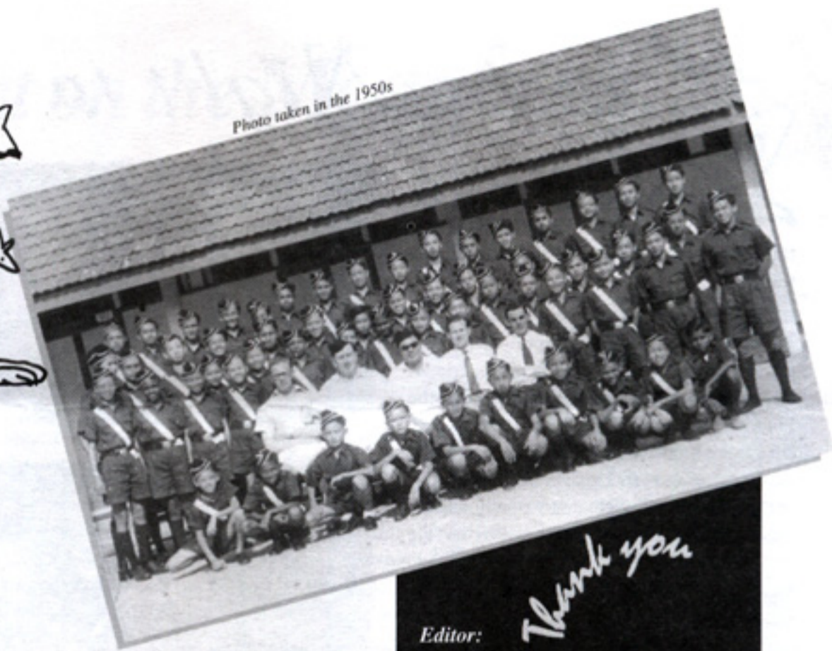
Photo taken in the 1950s