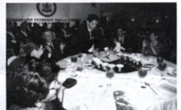
VIP table being served